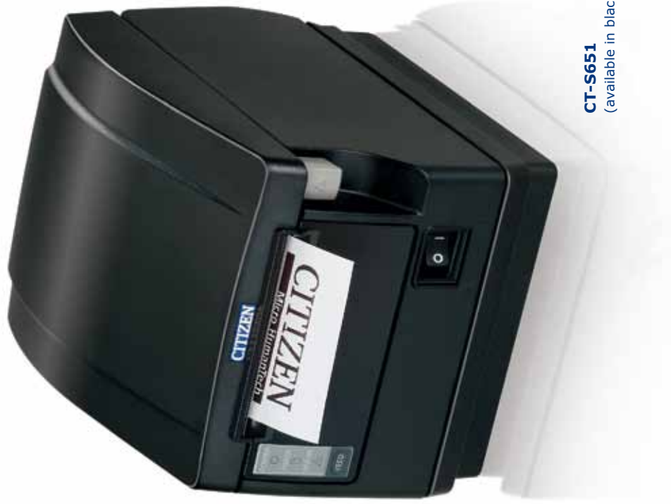
CT-S651 (available in black or white)